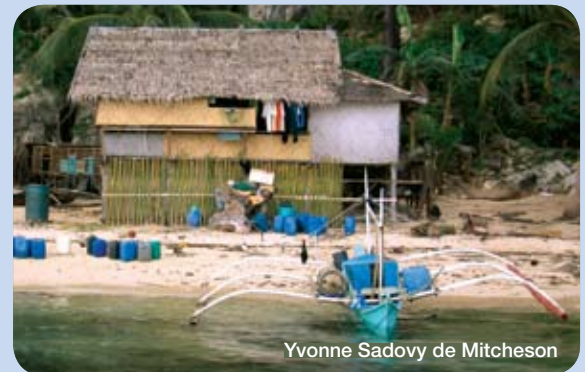
Yvonne Sadovy de Mitcheson

No-take Reserves are a valuable tool to be included when building a comprehensive integrated management program.